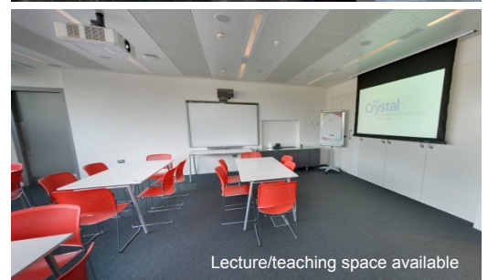
Lecture/teaching space available