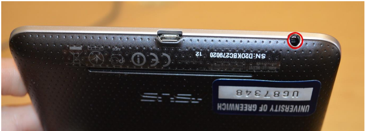
3.5 mm headset jack