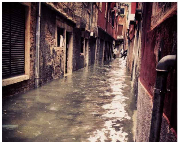
unit 5 in Venice 11.11.12